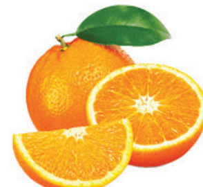
PIGMENT ORANGE SEGMENTS