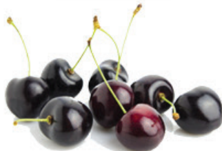
DARK SWEET CHERRY